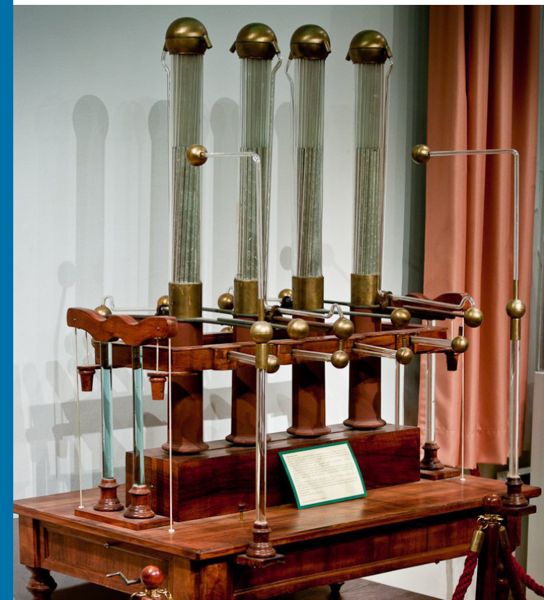
Jedlik's impulse generator, an early predecessor of the Marx impulse generator